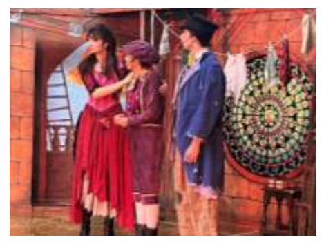
Nancy finds Oliver and brings him back to Fagin