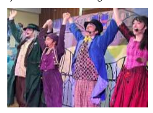
A musical ending had everyone clapping loudly!

We would very much like to rebook for next year but need parental donations to cover the cost so that we can bring theatre productions into school for every child. If you have not yet contributed £5 for your child, please support this brilliant experience by logging in to Parent Pay or bringing money to the office on Monday. Thank you so much.