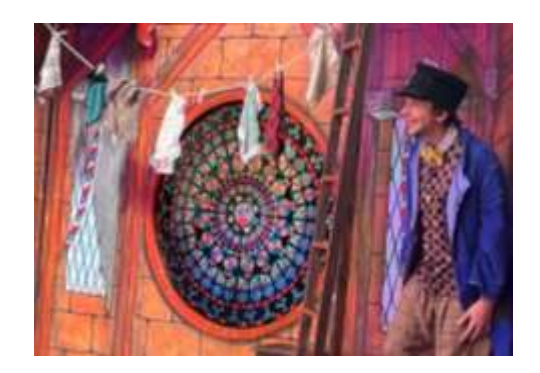
The Artful Dodger in Fagin's Den